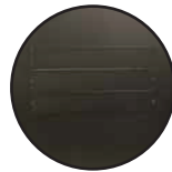
Cable access points in base, rear & roof