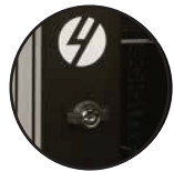
Lockable front & rear doors