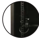
Screenprinted mounting rails