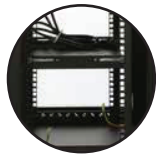
1 x Fixed shelves