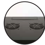
2-way Fan kit installed