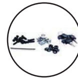
Cage nuts & screws included