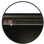
6-way Horizontal rackmount power rail