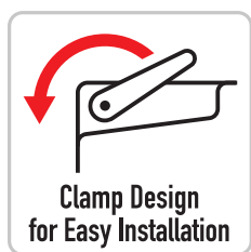
Clamp Design for Easy Installation