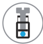
Type 22.32 Screw terminal