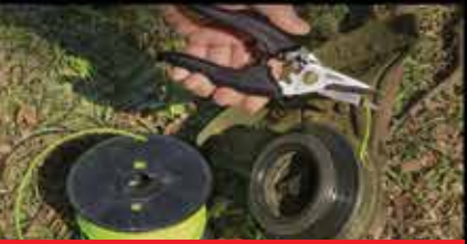
WHIPPER SNIPPER LINE