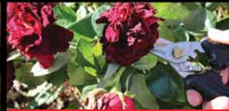
DEAD HEADING ROSES