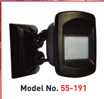
Model No. 55-191