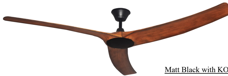
Matt Black with KOA Blades