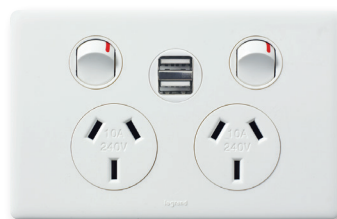
Application example EMUSB2PSWE + ED777XWE