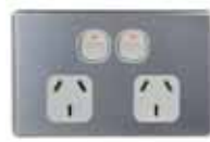
FLPP2GCBA (Cover, Brushed Aluminium) on FLPP2G