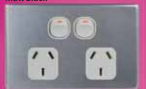
White with Brushed Aluminium cover