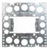
Mounting bracket HY1GMBPLR