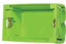
Plastic Wall Box Recessed with Sliding Nuts for Flat Cat - HY1GPWBR