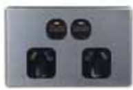
FLPP2GCBA (Cover, Brushed Aluminium) on FLPP2GBK