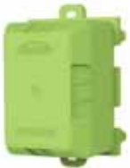
Shroud for Flat Cat HYSHRW