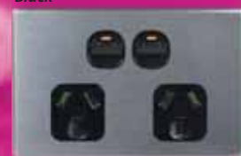
Black with Brushed Aluminium cover