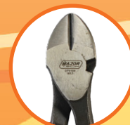
HRC 58-63 suitable for both hard & soft wire