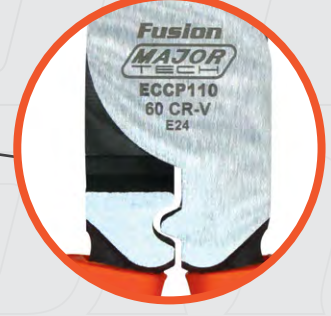
60CRV Chrome Vanadium Steel