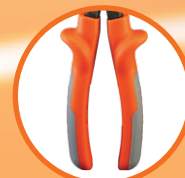
Heavy duty TPE rubber insulated handle grips