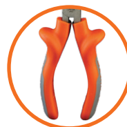
1000V Safe insulated handles