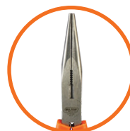
HRC 58-63 suitable for both hard & soft wire