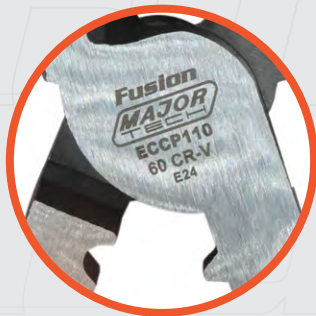
Terminal Crimping Slot