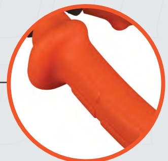
TPE Rubber 1000V Insulated Fusion Grip