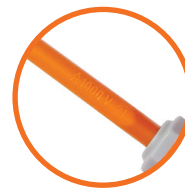
Chrome Vanadium 1000V Protective Sleeve