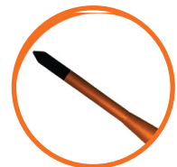
Slimline Design for Tight Spaces