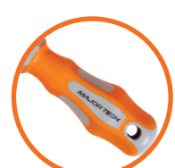
Power Grip/Soft Grip