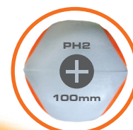
Size Markings for Easy Selection

KTK0306 | 6 Piece Slimline Screwdriver Set