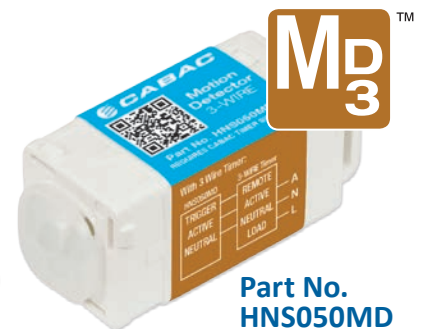
Part No. HNS050MD