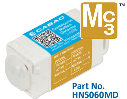
Part No. HNS060MD

In support of our policy of continuous product improvement we reserve the right to change materials and specifications without notice. Drawings, where used, are not to scale. All dimensions are in millimetres and sizes given are approximate. Where possible, technical MSDS data sheets are made available on the website. All products should be installed and used in accordance with manufacturer's instructions provided. Warning: products may be the subject of registered designs and patents. Refer to website for terms and conditions on warranty.