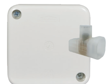
HYJB54T 70mm (w) x 70mm (h) x 35.5mm (d)