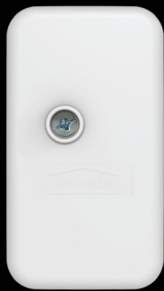
HYJB43T / HYJB3TE