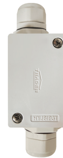
HYJBIP3T 45mm (w) x 96mm (h) x 39mm (d)