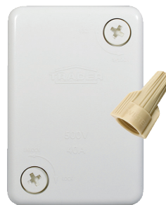
HYJB4TFT 68mm (w) x 99.5mm (h) x 47.5mm (d)