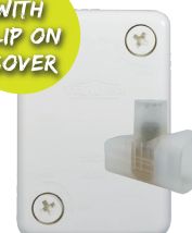
HYJB4TFC 68mm (w) x 99.5mm (h) x 47.5mm (d)