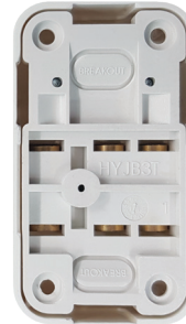
HYJB43T (Back view)