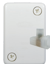
HYJB4TF 68mm (w) x 99.5mm (h) x 47.5mm (d)