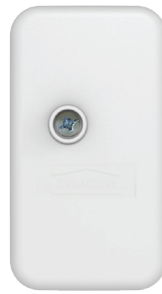
HYJB43T 41mm (w) x 73mm (h) x 26mm (d)