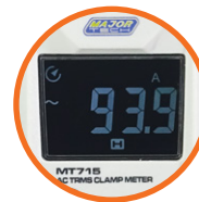
6000 Count Backlight Negative LCD Display