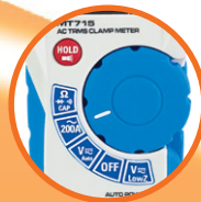
Range markings are backlit for use in dimly lit areas