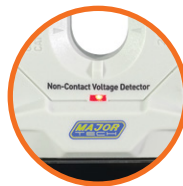
Red Light indicates detection of Non Contact Voltage (NCV)