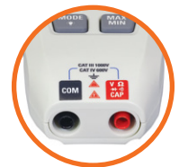
Rear entry of standard 4mm Test Lead Terminals