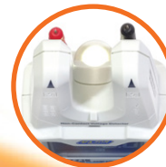
Meter includes flash light to light up area of test