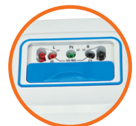
Safety Design with Sliding Shield Plate to Avoid Electric Shock