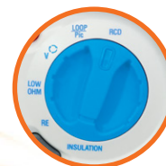
8 Functions: Insulation Resistance, Earth Resistance, Low OHM, Voltage, Loop Impedance, RCD, PSC/PFC & Phase Rotation