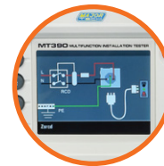
3.5" TFT Colour LCD Display with 320x240 Pixels