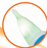
Glow Voltage Tip