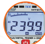
4000 Count Backlit LCD with 41 Segment Bargraph