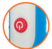
On and Off Switch