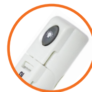
Built in Flashlight