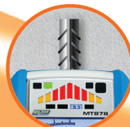
LED's Illuminate once Stud, Metals & Live AC Wires are Detected