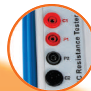
Voltage & Current Terminals