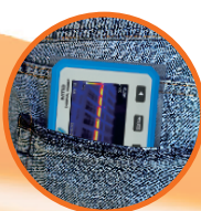
Compact & Convenient Size