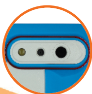
2 Megapixels FOV: 62° x 46.5°