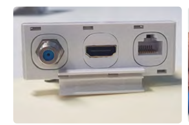
Jack clip in plate comes separate for easy installation and termination