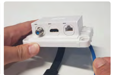
View shows assembly where plate has been completely clipped in ready for installation .