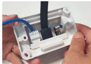
View shows underside where plate has been completely clipped in.