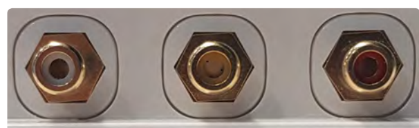
Examples of alternative solutions showing audio visual jacks being fitted to the Puma Entertainment Plate product