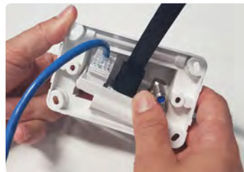
Pre-assembled and terminated plate can be rotated into position and clipped into place.