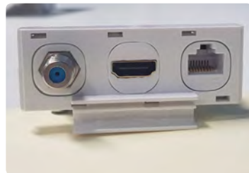
Jack clip in plate comes separate for easy installation and termination

PU = Puma ENT = Entertainment P = Plate 3G = 3 GANG TVA - Television Accessories (Foxtel TV, Cat 6 Data and HDMI (2.0) all included)