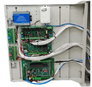
Capacity for Multiple Systems