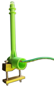
1 X BOND POINT