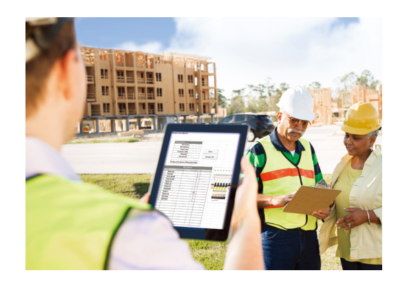
*Minimum order of 50 pre-assembled load centres

The easier, quicker way to configure your plastic switchboards has arrived.